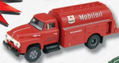
30231/ 50300 - Mobil Fuel Oil