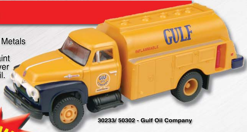
30233/ 50302 - Gulf Oil Company