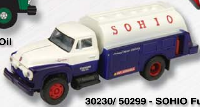
30230/ 50299 - SOHIO Fuel Oil