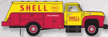
30258/ 50325 - Shell Oil Company

Ford's F-700 was the low-cost leader of the commercial trucking world from the Mid-50's throughout the 1960's. Mini Metals HO and N scale F-700 tank trucks are realistically crafted "Transition Era" miniatures in authentic Post World War II paint schemes. BONUS! HO scale trucks include a uniformed Driver Figure, sculpted and painted with our usual attention to detail.