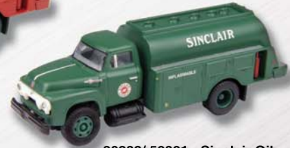
30232/ 50301 - Sinclair Oil