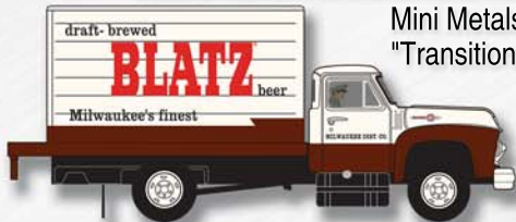
30241/ 50310 - Blatz Beer Delivery Truck

Mini Metals HO and N scale F-700 Delivery trucks are realistically crafted "Transition Era" miniatures in authentic Post World War II paint schemes. BONUS! HO scale trucks include a 50's era uniformed Driver Figure sculpted and painted with our usual attention to detail.