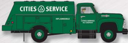
30259/ 50326 - Cities Service Oil