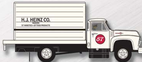
30240/ 50309 - H. J. Heinz Delivery Truck